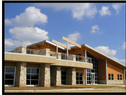
Location Springfield Botanical Gardens