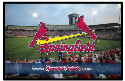
For Fun! Springfield Cardinals Game!