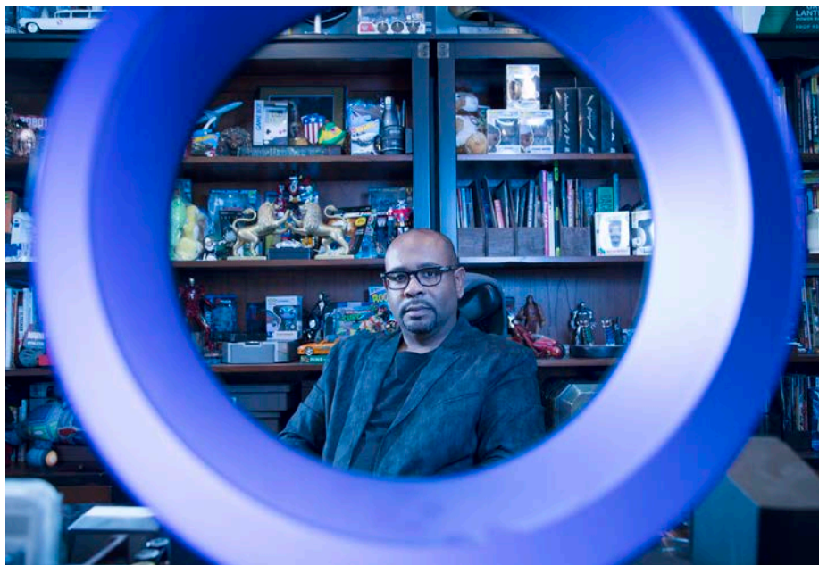
Dilip Vishwanat and the St. Louis Business Journal took first in Best Feature Photograph for this shot of a local businessman paired with a feature story about a new business venture. (Submitted photo)