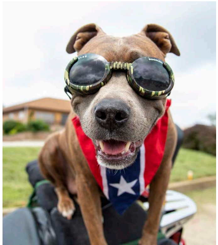
Mitch Prentice captured the spirit of the dog days of summer at Lake of the Ozarks with this first-place Best Feature Photograph winning entry for the Lake Sun Leader .