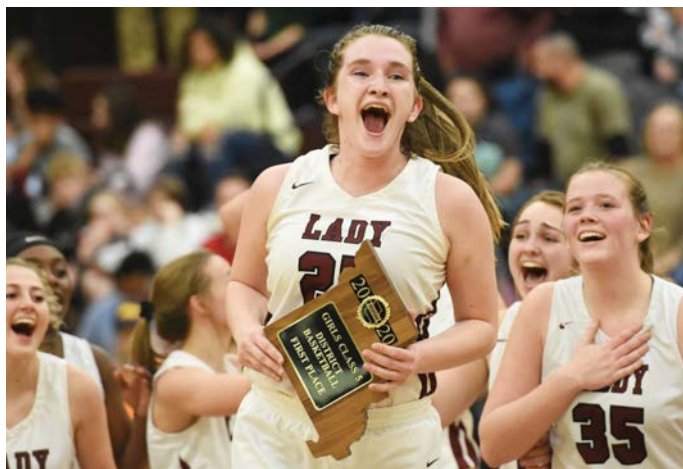
Scott Borkgren of the Poplar Bluff Daily American Republic captured this celebration for first place in Best Sports Feature Photo for mid-size dailies.