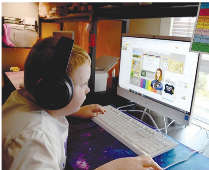
Kimberly Langston won first for small dailies Best News Photo with this capture for the West Plains Daily Quill .