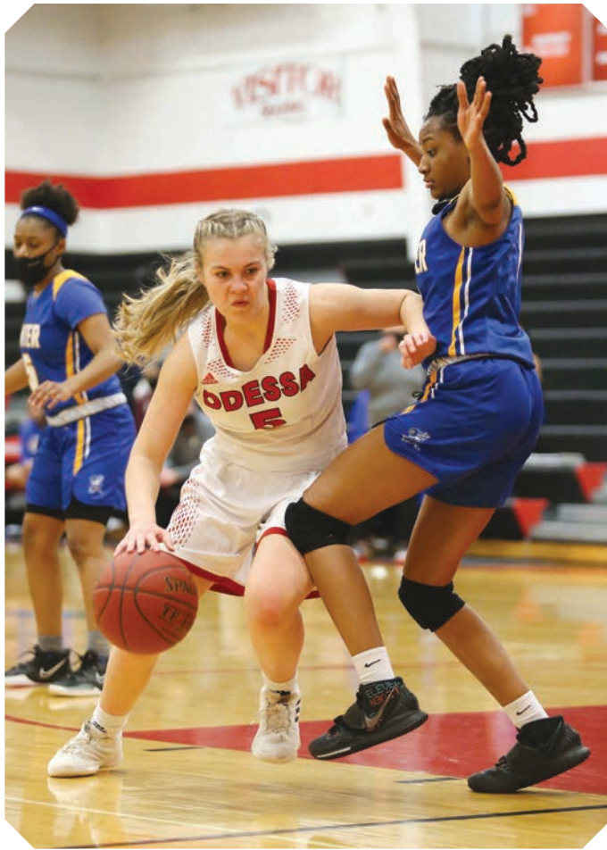
Kory Hales captured this player's determination on the court and won The Odessan a first-place win for Best Sports Photo for mid-size weeklies.