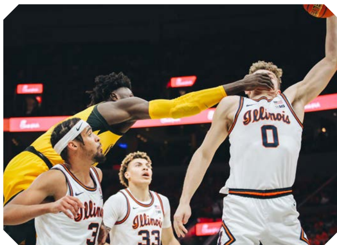
Madeline Carter blocked the competition to pull down a first place win for the Columbia Daily Tribune in Best Sports Photograph for medium dailies.