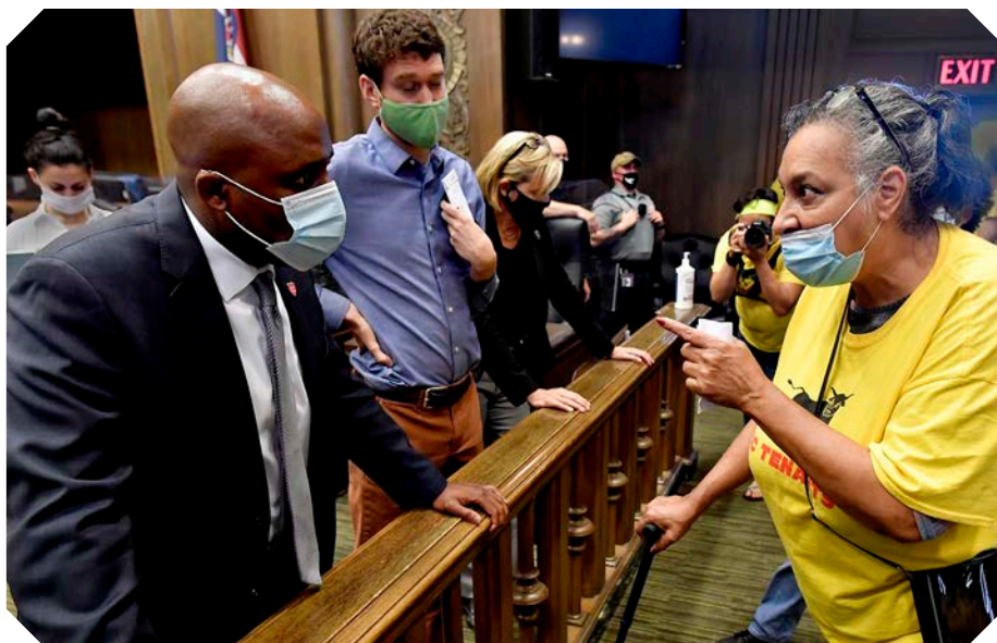
A snapshot of conflict between a mayor and residents made for a first place Best News Photo win for The Kansas City Star's Rich Sugg.

Best Local Business Coverage Kahoka The Media — Mike Scott