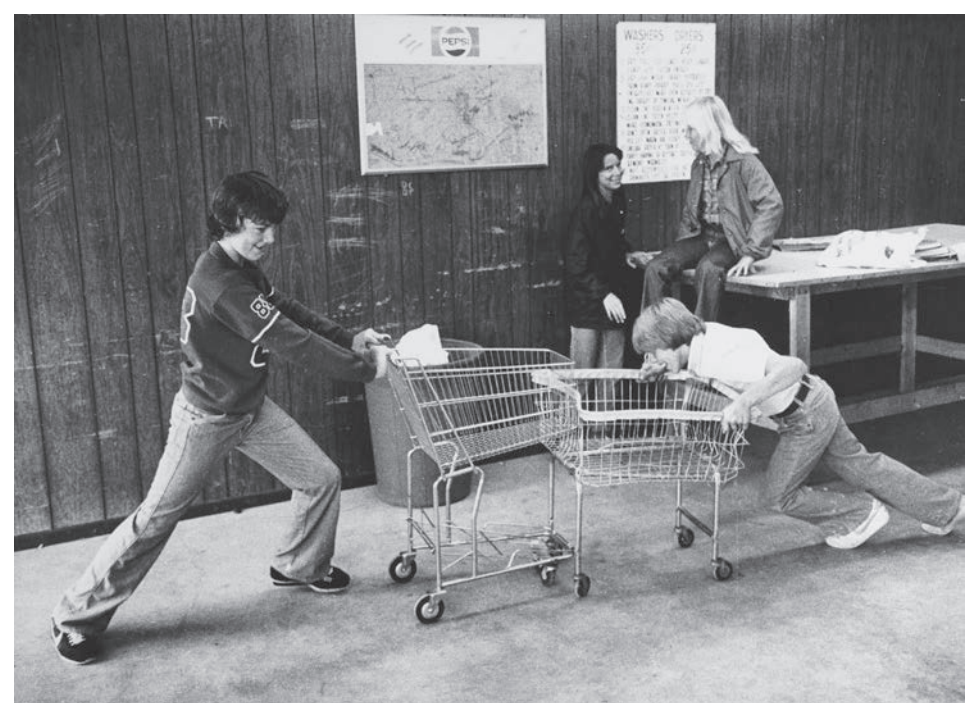
Missouri Photo Workshop has been to Sedalia once before, at MPW 32 in 1980 in Sedalia. This photo is by Jim Burton, who was a photographer at the Topeka Capital-Journal . This photo depicts youths passing the time in a laundromat. (Submitted photo)