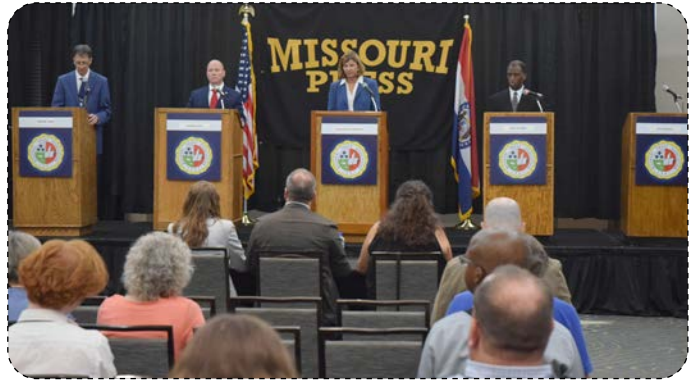
Missouri Press Association last hosted candidate forums at 2022's 156th Annual Convention in Lake Ozark. Forums for state auditor and U.S. Senate were held, with all candidates on the November ballot for both races being invited and all but one participating.

MPA is working on finalizing the Convention agenda, with tentative speakers planned to address topics such as artificial intelligence's uses, social media versus smalltown newspapers and the conversation around free press following the raid of the Marion County Record in Kansas.