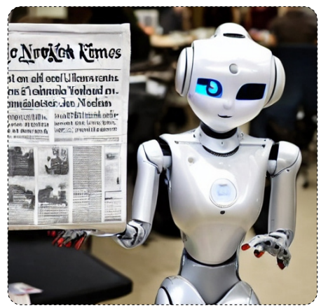
Believe it or not, this image of "a humanoid robot reading the New York Times newspaper" was created by an Al image generator. Unfortunately, not all Al images are so obviously suspect, and the misinformation or disinformation they spread could be much more subtle. Share the media literacy tips on page 9 with your readers, including those still in school to help them better think critically about the information they consume.

Spaar, who asked Headrick for help creating an easy-to-follow sheet for students in The Odessan's coverage area, said NIE resources like the tip sheet and the overall program are important for teaching students how to consume all media, from their hometown newspaper to articles they