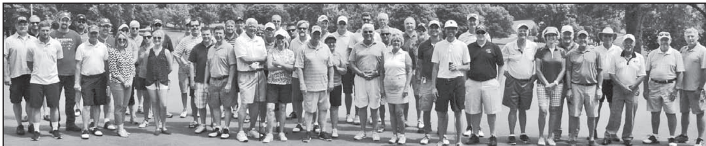
Twelve teams of golfers helped raise nearly $5,000 for the Missouri Press Foundation at the 2015 Porter Fisher Golf Classic.